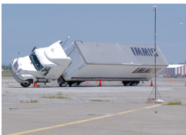
Outdoor roll test

Whether it is a remote control roll or a test on the 90° dynamic rollover impact machine, CAPE tests the occupant restraints and product performance while capturing real world crash sensor data. Those findings have led to significant advancements in safety for the industry and the men and women who drive it forward.