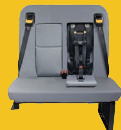
2 ICS - 2 Belts