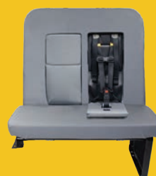
2 ICS - No Belts

No more lugging child seats across the bus yard every day. SafeGuard's versatile Integrated Child Seat eliminates the need for add-on restraints or child seats for younger children. Available for school buses, the SafeGuard ICS® offers the security of a built-in child restraint system with a five-point harness for children 26.5 to 85 lbs.