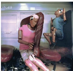
Unbelted passengers in a crash demonstration