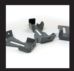
SCBA Tank Brackets