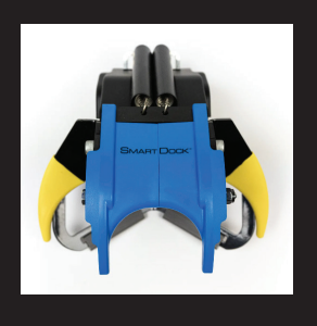
Upper Head Unit