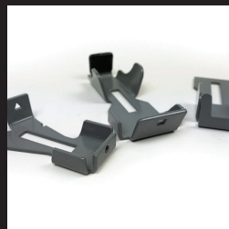
SCBA Tank Brackets