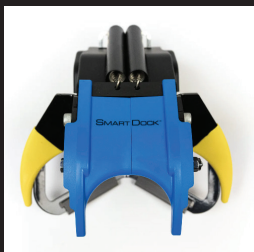
Upper Head Unit