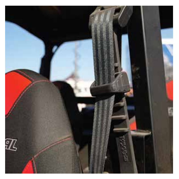
A little dirt doesn't scare us. Cleaning T/Rail is easy...just wash with water. Refer to your vehicle's Owner's Manual for how to clean your seat belt.