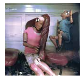
Unbelted passengers in a crash demonstration