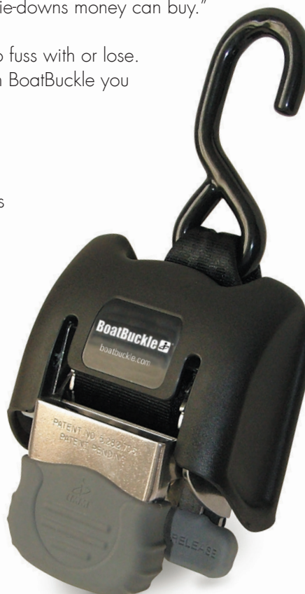
BoatBuckle 2" Retractable Stainless Steel Transom Tie-Down