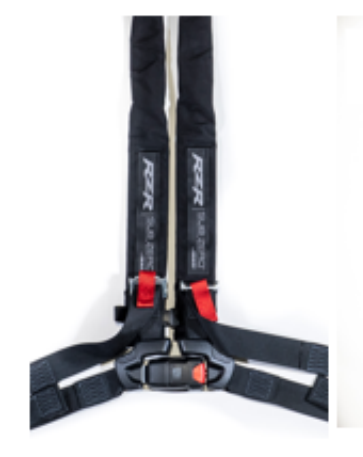
Polaris Sub Zero