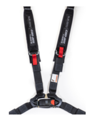
CanAm Sub Zero