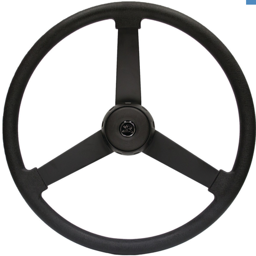
Shown above: polyurethane molded foam grip with solid black spokes