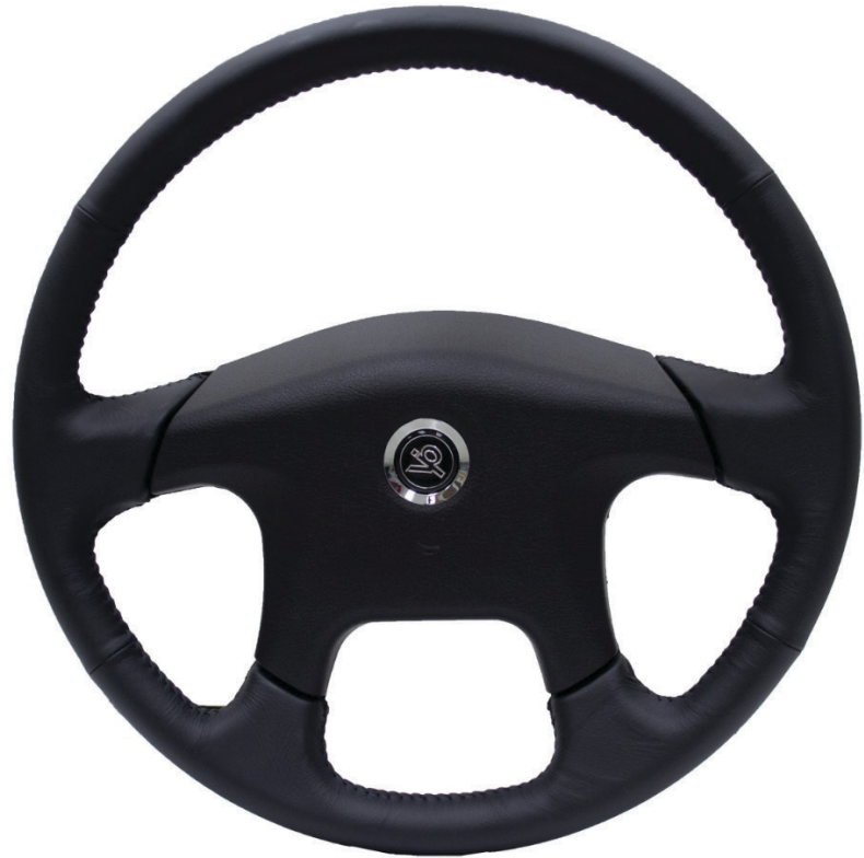
Shown above: premium full-grain leather grip