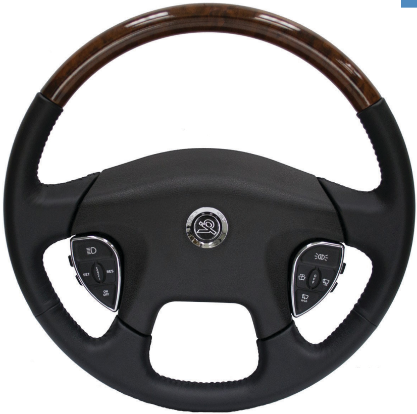
Shown above: simulated burl wood and full-grain leather grip SmartWheel controls: 10 function buttons + 4 two-way paddles (18 total functions)