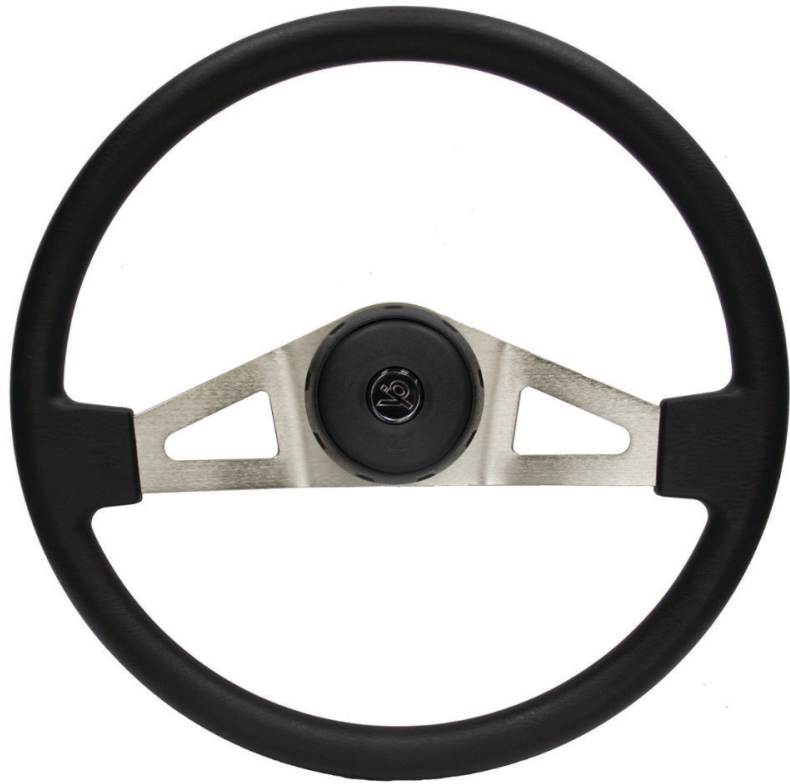
Shown above: polyurethane molded foam grip with brushed nickel plate spokes