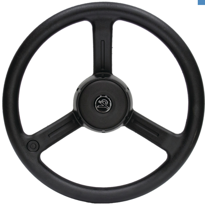
Shown above: fully molded vinyl grip, spokes, and top cap for extreme durability and maximum corrosion resistance