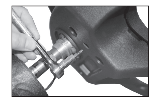
Figure 6 (Shown with gap hider removed for clarity)