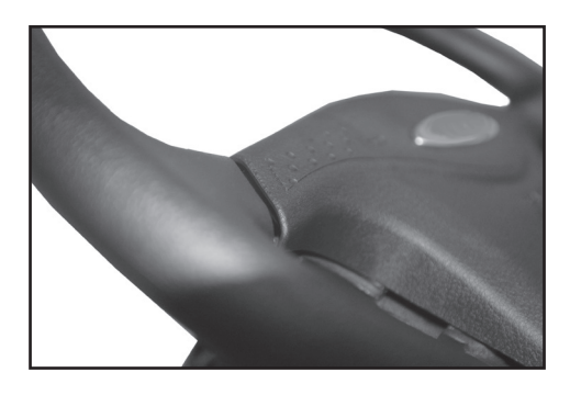
Figure 8 Correct