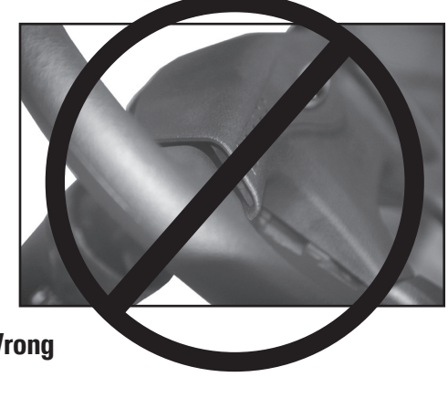
Figure 7 Wrong