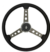
Leather Wrapped Grip, Custom Exposed Spokes