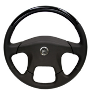
Hydrographic Dip/ Leather Grip, Fully Molded Spokes