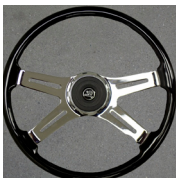
Custom Painted Wood Grip, Exposed Chrome Spokes

Shown above: genuine mahogany wood finish, chrome spokes with slots