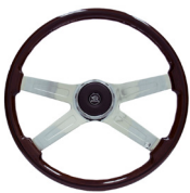
Mahogany Wood Grip, Exposed Chrome Spokes