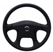
Leather Wrapped Grip, Fully Molded Spokes