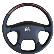
Simulated Burl Wood Grip, Fully Molded Spokes