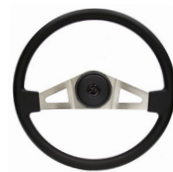
Polyurethane Foam Grip, Brushed Nickel Spokes