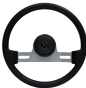
Polyurethane Foam Grip, Exposed Silver Spokes