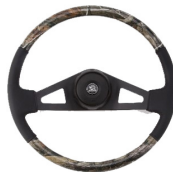
Hydrographic Dip/ Leather Grip, Exposed Black Spokes