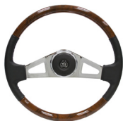
Simulated Burl Wood Grip, Exposed Chrome Spokes