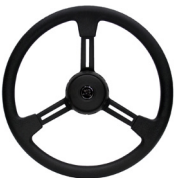
Vinyl Grip, Exposed Black Spokes