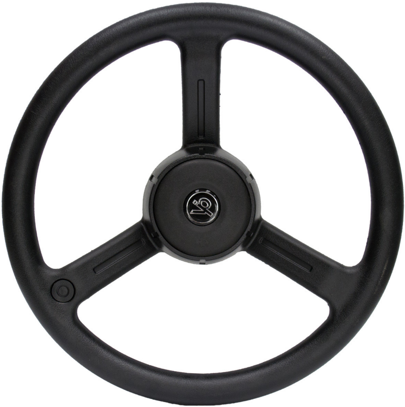
Shown above: vinyl grip with fully molded spokes