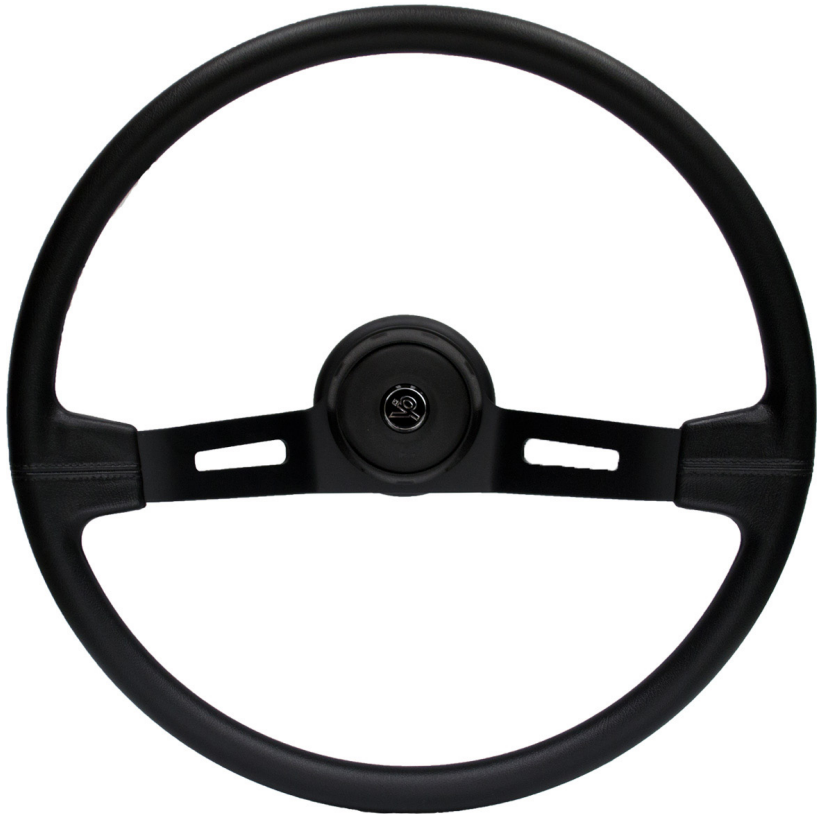
Shown above: vinyl grip with exposed black spokes