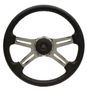
Leather Wrapped Grip, Exposed Chrome Spokes