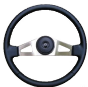
Leather Wrapped Grip, Brushed Nickel Spokes

Shown above: polyurethane foam grip with exposed black spokes