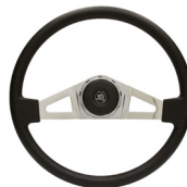
Polyurethane Foam Grip, Exposed Chrome Spokes