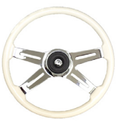
Custom Painted Wood Grip, Exposed Chrome Spokes