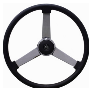
Vinyl Grip, Exposed Chrome Spokes

Shown above: polyurethane foam grip with exposed black spokes