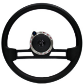
Military Quick- Release, Exposed Black Spokes