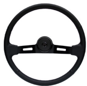
Leather Wrapped Grip, Exposed Black Spokes