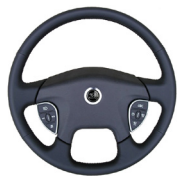
Leather Wrapped Grip, Fully Molded Spokes