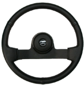
Leather Wrapped Grip, Exposed Black Spokes