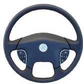
Polyurethane Foam Grip, Fully Molded Spokes