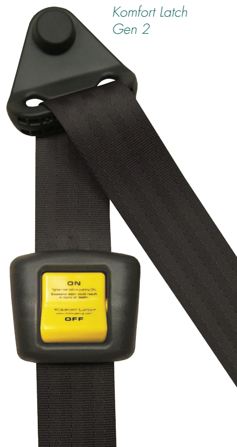
Komfort Latch Gen 2