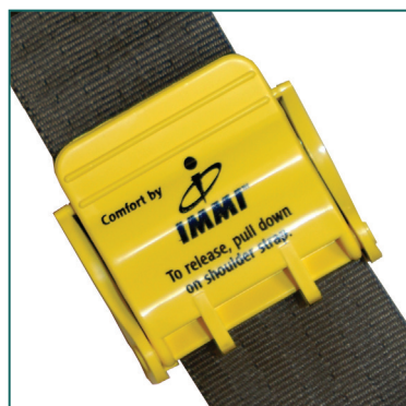
Komfort Latch Gen 1

Should the vehicle experience a sudden deceleration while the Komfort Latch is in use, the seat belt will still lock as needed.